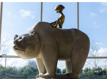
PA-4: Boy and Bear by Marshall Fredericks captures the endearing relationship between an enormous animal and a small child. The sculpture resides in Southfield Public Library Atrium and is visible at all times from outside the building.