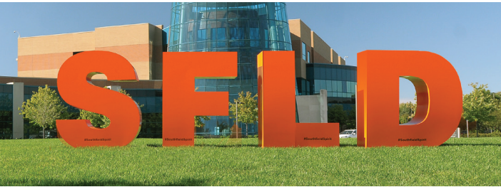
PA-1: SFLD by T.E.C., Jr. and Signs by Crannie has become the iconic placemaking feature on the front lawn of the Donald F. Fracassi Municipal Campus. Four orange letters abbreviate the city’s name and serve as a favorite “selfie” destination.

For a complete guide to the public art collection, download the PocketSights app to your mobile device and search “Southfield, Michigan” for guided tours.