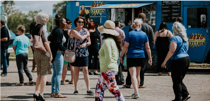
Eat to the Beat At lunchtime on the second Thursday of the month from June to September, Southfield City Centre comes alive with music, people, and an array of food trucks. Come, have lunch and enjoy.