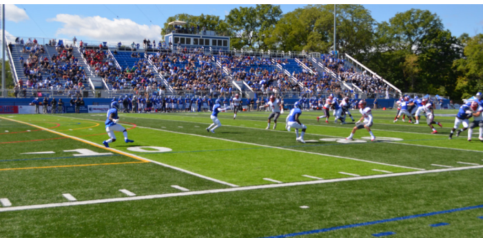
CS-4: Lawrence Technological University Founded on the principle that every person should have the opportunity for a college education, this mid-sized private university offers undergraduate and graduate degrees in architecture and design, the arts and sciences, business and information technology, and engineering, as well as an undergraduate nursing program in partnership with Ascension Michigan. The university also offers robust, extracurricular athletics.